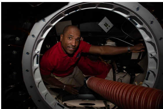
Victor J. Glover, Jr., NASA Astronaut | Commander, U.S. Navy