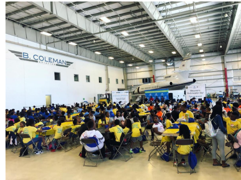
Boeing partners with AeroStar, Gary Boys & Girls Club, and the FAA Great Lakes Region to host Gary Aviation Day, with activities and lunch for more than 500 youth.