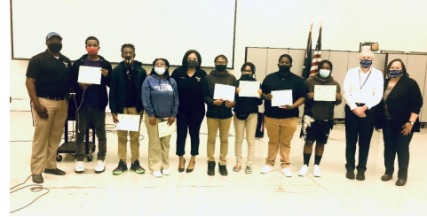
Eight students received certificates of completion; two received their Student Airmen Certificates (student pilot's licenses) from the FAA.