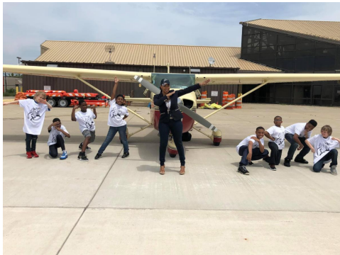
Boeing-sponsored Boys & Girls Club K-8 AeroStar Program takes kids for airplane rides at Gary Airport.