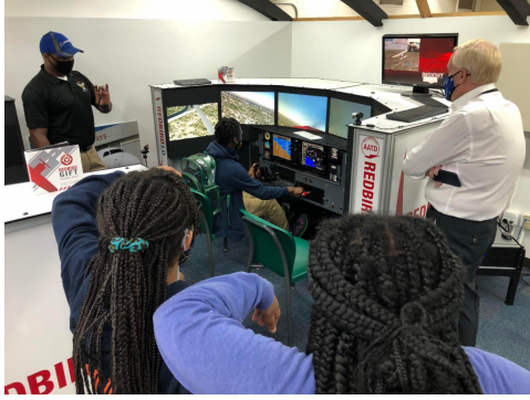
Boeing partnered with AeroStar to launch Gary's first Aviation High School Career and Technical Education (CTE) Program at the Gary Area Career Center.